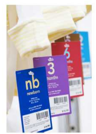
Investor Presentation March 23, 2007